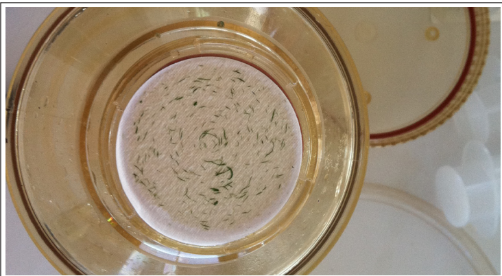
In 2011, a new kind of bloom was detected in the Delta – the filamentous cyanobacteria Aphanizomenon . The round cells in the net are Microcystis .

Samples were tested for algae cell abundances and toxin concentrations. Nutrient levels, salinity, water clarity, irradiance, water temperature, and water residence time (flow) were also measured, as all may contribute to bloom formation.